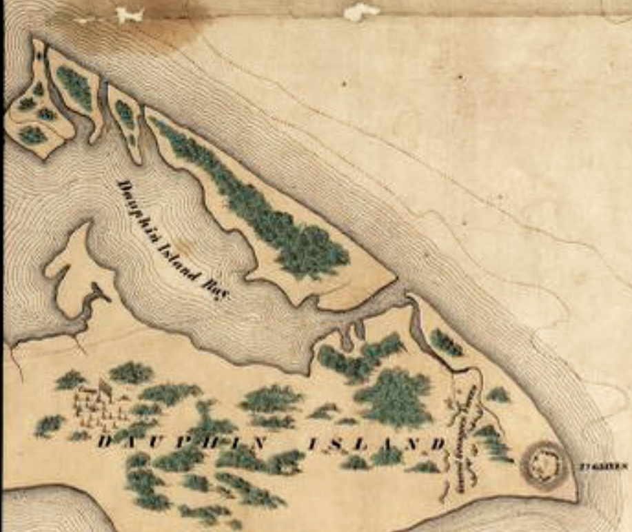
CHART SHOWING THE ENTRANCE OF REAR ADMIRAL FARRAGUT INTO MOBILE BAY. 5 th of August 1864.